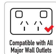
Compatible with All Major Wall Outlets