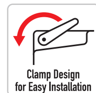
Clamp Design for Easy Installation