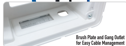
Brush Plate and Gang Outlet for Easy Cable Management