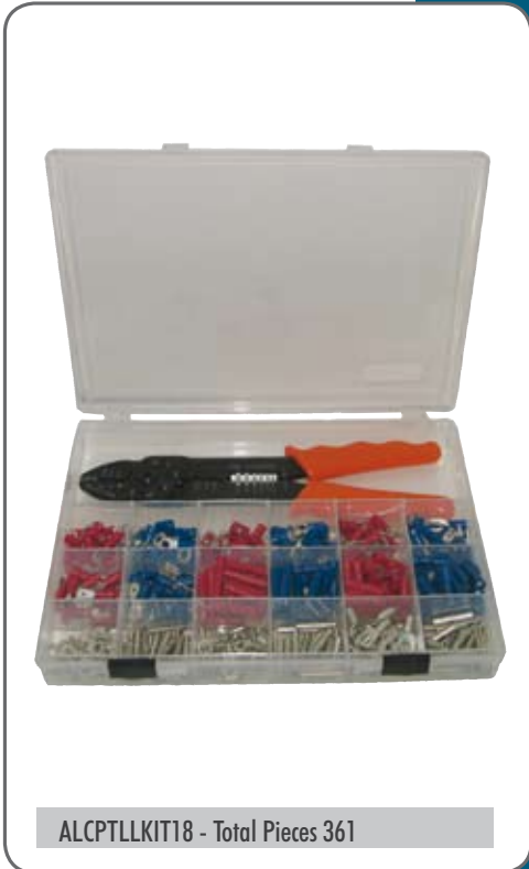
ALCPTLLKIT18 - Total Pieces 361