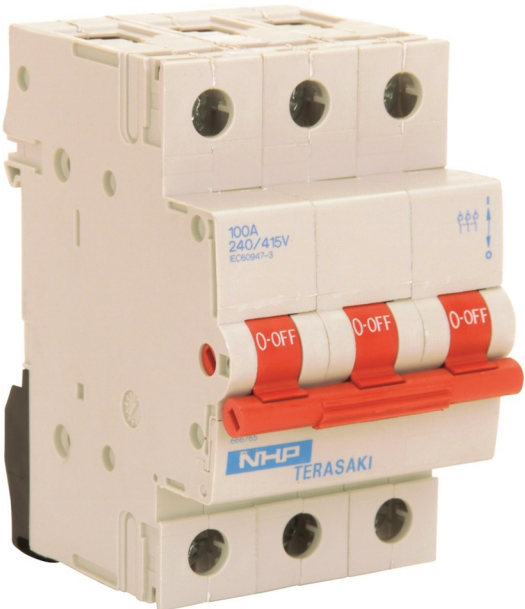
MOD6 main switch, DIN rail, 3P, 100A

Representative Photo Only (actual product may vary based on configuration selections)