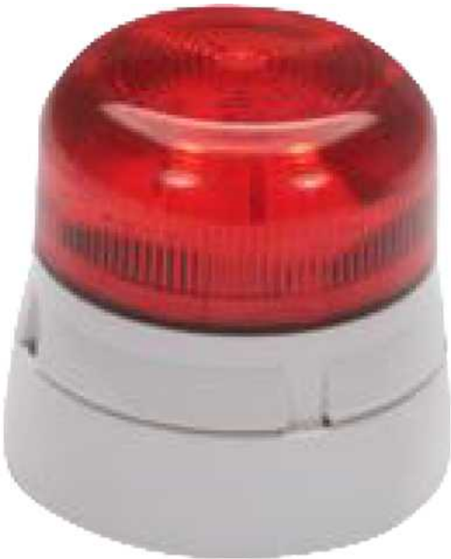
Xenon Beacon (Strobe) 12/24V DC - Red Lens. 1.4 Joule Light Energy

Representative Photo Only (actual product may vary based on configuration selections)